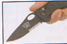
Chamfered thumbhole makes the BWGF5 easy to open and close.