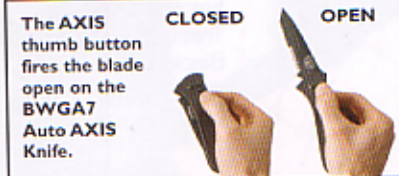
The AXIS thumb button fires the blade open on the BWGA7 Auto AXIS Knife.

Note: Know your laws. This knife may not be legal in all jurisdictions.