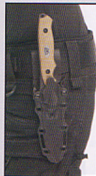
Knife sheath carries knife vertically...