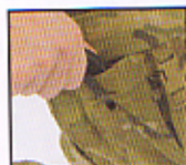
Carry Clip allows easy access for pocket carry