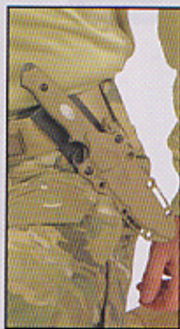
or can pivot for comfort and mobility.